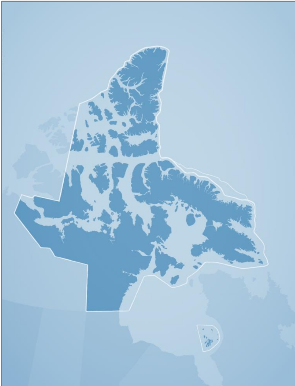
Figure 1: Map of the Nunavut Settlement Area and Outer Land Fast Ice Zone